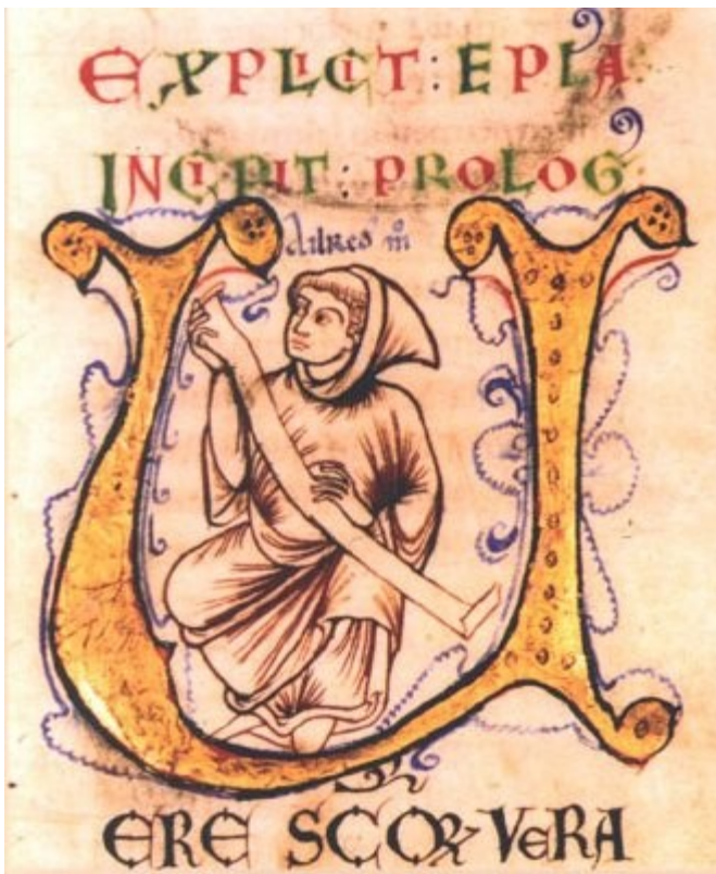
Fig. 1. Aelred of Rievaulx ca. 1140 CE.

Walter Daniel, writing shortly after Aelred's death in the twelfth century, originally attempted to employ standard formulae about Aelred as monk-like and chaste even before he took his vows, but his readers protested: Aelred had a reputation that remained infamous, and Walter was forced to admit that Aelred had been sexually active in his youth. Aelred himself, looking back from old age as he wrote Spiritual Friendship , seems to recall this time with considerable (if complicated) fondness. "The charm of my companions pleased me very much," he wrote, "and so, torn between conflicting loves and friendships, I was drawn now here, now there, and not knowing the law of true friendship, I was often deceived by its mere semblance." 22 In addition to the charms of love and friendship, in other writings he also offers a glimpse of the cruelty and exploitation he may have experienced at the hands of men in the King's court: